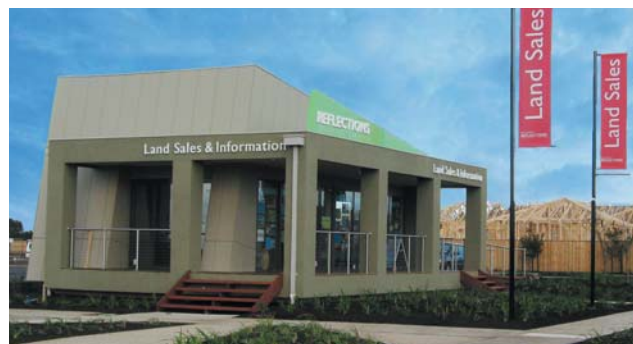
Exterior - Land Sales and Information centre