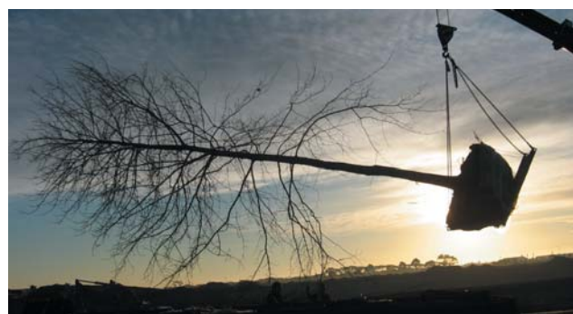
Pin Oak being craned into position in front of the Land Sales and Information centre