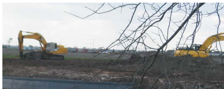
Reflections taking shape

And a planned fitness trail will provide further exercise opportunities for those who take fitness more seriously.