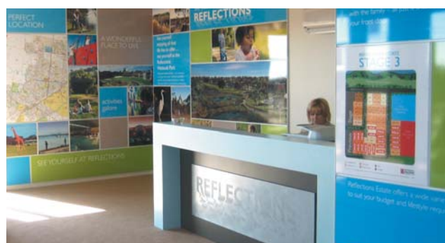
Reception Area - Land and Sales office

www.reflectionsestate.com.au 1300 BUY LAND